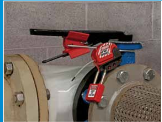
S3920 secure with S806 cable lockout device